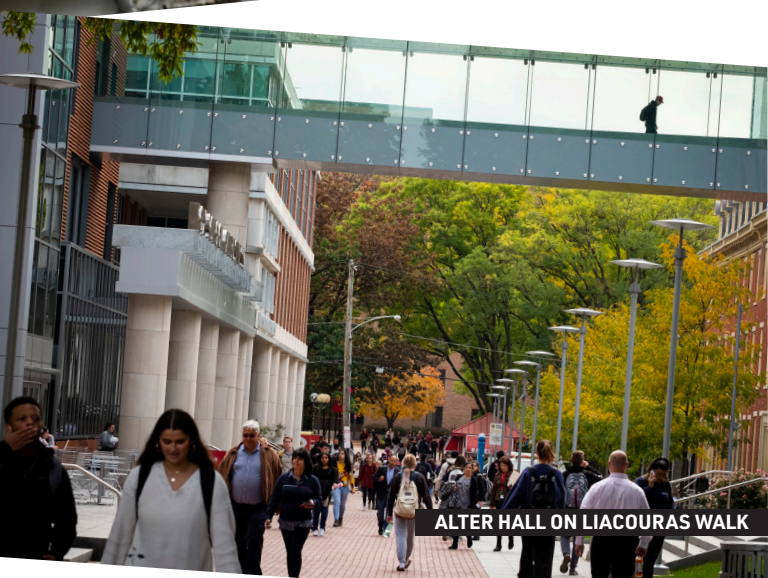
ALTER HALL ON LIACOURAS WALK

These spaces are must-see spots for anyone visiting campus and are easily accessible for all. Please note that Temple's campus is secure and most other buildings require identification to enter. If you want to go inside academic buildings and residence halls, please schedule a tour with the Welcome Center (#69 on map).